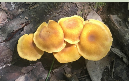
It's chanterelle season! These mushrooms were found in Pearl River WMA.