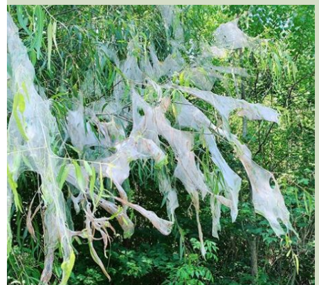
The ghostly home of a Tent Caterpillar