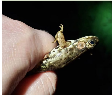
Night time frogging!