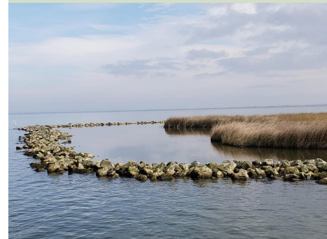
UNO's CERF CE workshop on lake Pontchartrain.