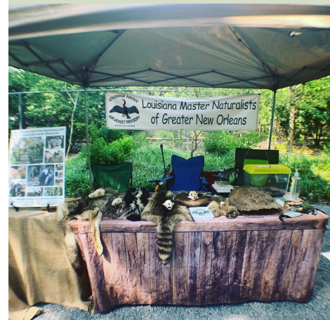
Tabling at New Orleans City Park Botanical Gardens.